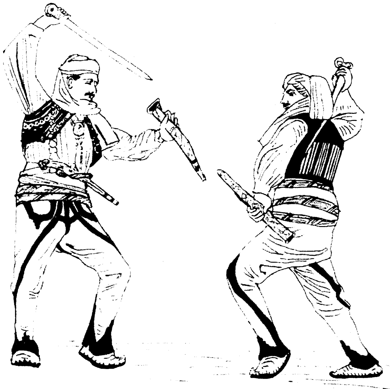
'borbena rugovska igra' – Sqiptar dance from Kosmet Southern Yugoslavia.